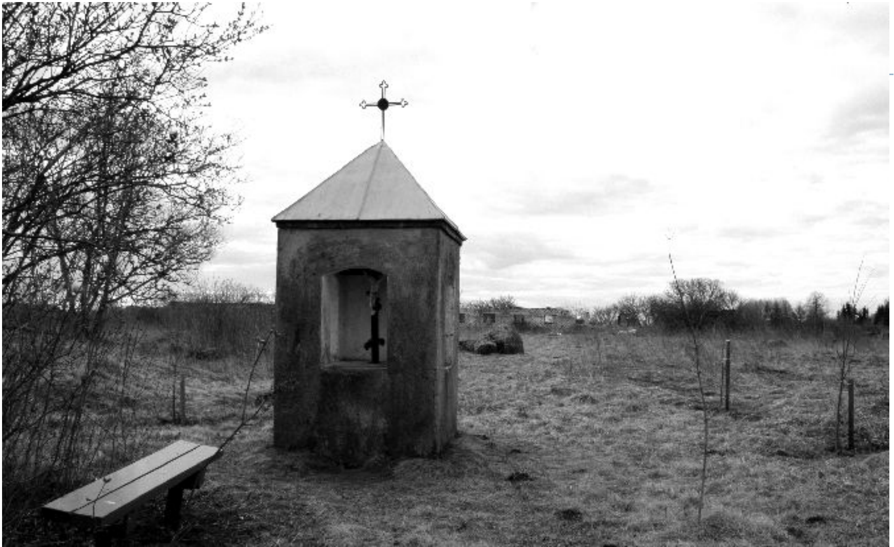
Different historical layers in landscape (palimpsest)